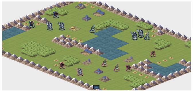
Fig. 1: An example of a game in the Stratega framework.

To evaluate agents in different strategy games, we use the Stratega [28] framework where new games can be quickly implemented. The battlefield in Stratega is depicted in an isometric view, where each tile can hold one or several elements such as landforms, buildings, resources, and army units (see Figure 1). One of the key features of Stratega is that a forward model is provided to support statistical forward planning methods, such as MCTS or Rolling Horizon Evolution [29]. We use three games from Stratega – Kill The