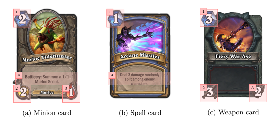
Fig. 2: General card types: cards include (1) mana cost , (2) attack damage, (3) health/durability, (4) and special effects.

number of attacks till the weapon breaks. Only one weapon can be equipped at the same time.