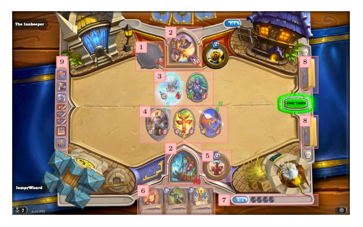
Fig. 1: Elements of the Hearthstone game board: (1) weapon slot (2) hero (bottom: player, top: opponent) (3) opponent's minions, (4) player's minions, (5) hero power, (6) hand cards, (7) mana, (8) decks, (9) history

make it possible to quickly compare agents, and their related methods, by letting them play against each other. The development of artificial intelligence (AI) agents for games often involves solving decision-making tasks, for which heuristic search processes, such as Monte Carlo Tree Search (MCTS) are frequently used [2].